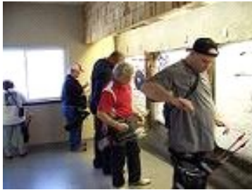
Morning Group scoring at the CBH v CPDAA event on January 9